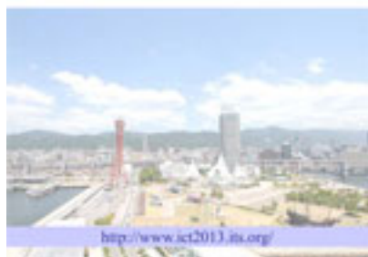
Japanese Conference Prospectus [8]